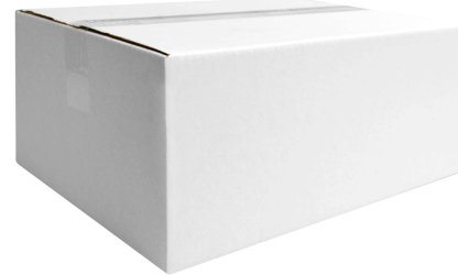
3# 50-60 SHRIMP BAG - FRONT